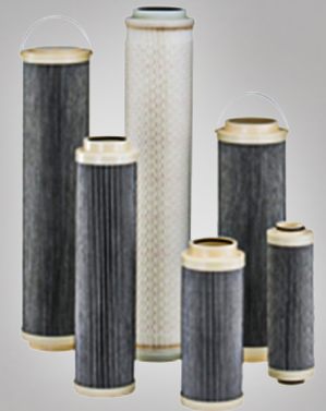
HyPro Filter Elements

panels. Because we were onsite during the initial testing and proving stage, both our customer and the end user's became very educated on cleanliness levels and fluid conditioning.